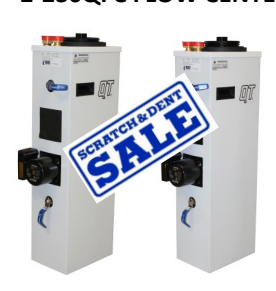
Scan for Scratch/Dent inventory here